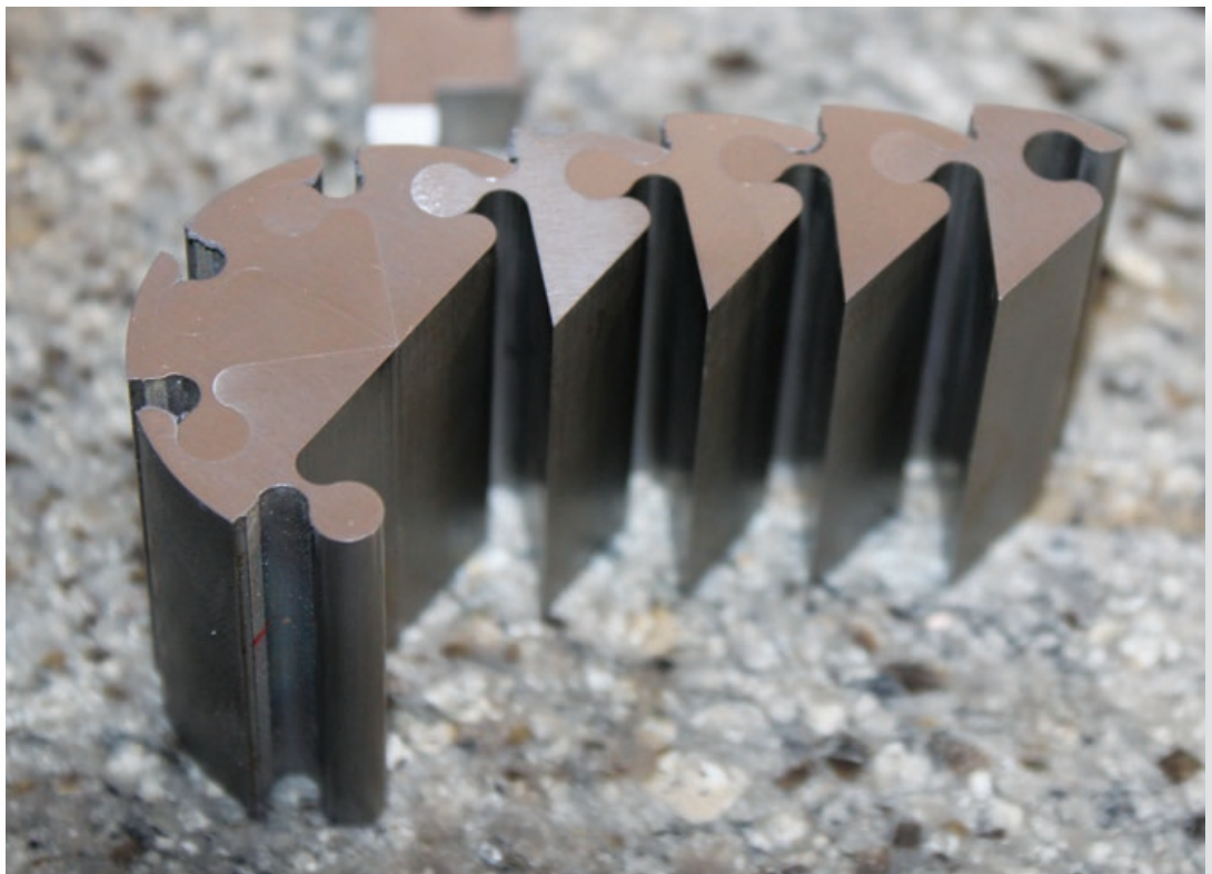
Webster Test Cut Showing Surface Finish and Fit